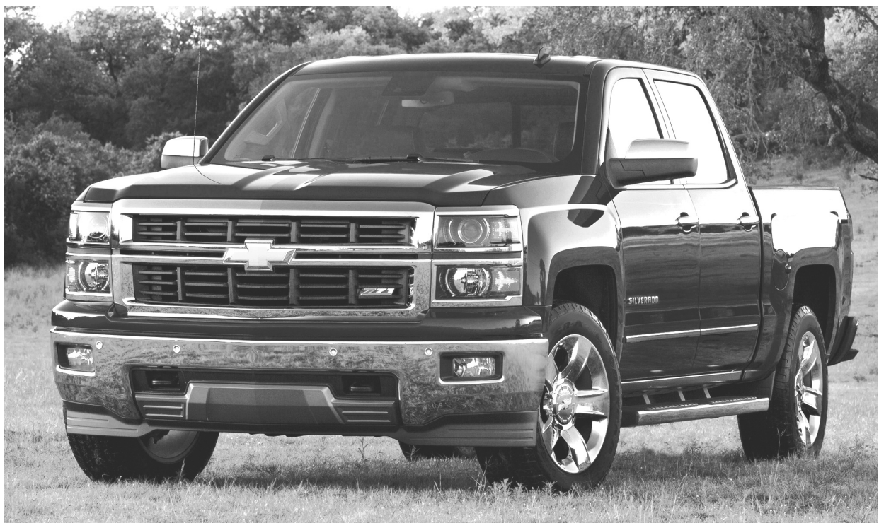
When the all-new 2014 GMC Sierra full-size pickup arrives this summer, its standard 4.3L EcoTec V-6 it will offer the most torque of any standard V-6 in the segment